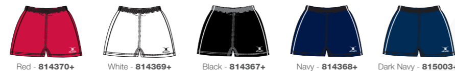
Red - 814370+ White - 814369+ Black - 814367+ Navy - 814368+ Dark Navy - 815003+