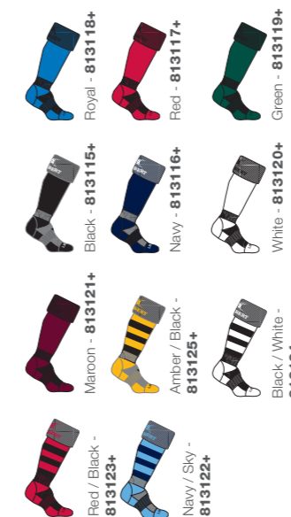
Royal - 813118+ Red - 813117+ Green - 813119+ Black - 813115+ Navy - 813116+ White - 813120+ Maroon - 813121+ Amber/Black - 813125+ Black/White - 813124+ Red/Black - 813123+ Navy/Sky - 813122+