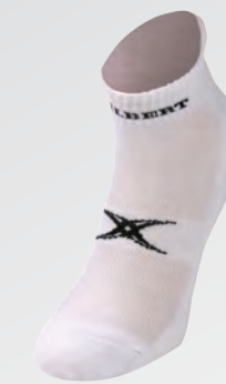
Small - 81439804 Medium - 81439805 Large - 81439806