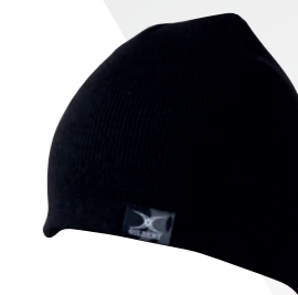
Black - 81453005 Navy - 81453105