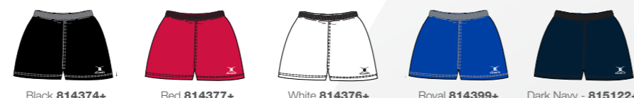
Black 814374+ Red 814377+ White 814376+ Royal 814399+ Dark Navy - 815122+