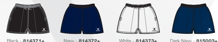
Black - 814371+ Navy - 814372+ White - 814373+ Dark Navy - 815003+