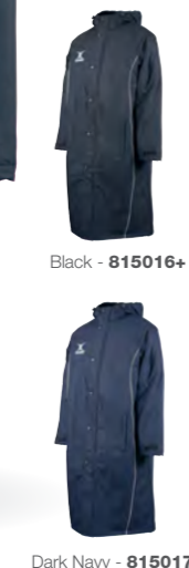
Black - 815016+ Dark Navy - 815017+