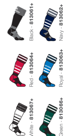
Black - 813061+ Navy - 813062+ Red - 813064+ Royal - 813063+ White - 813067+ Green - 813066+